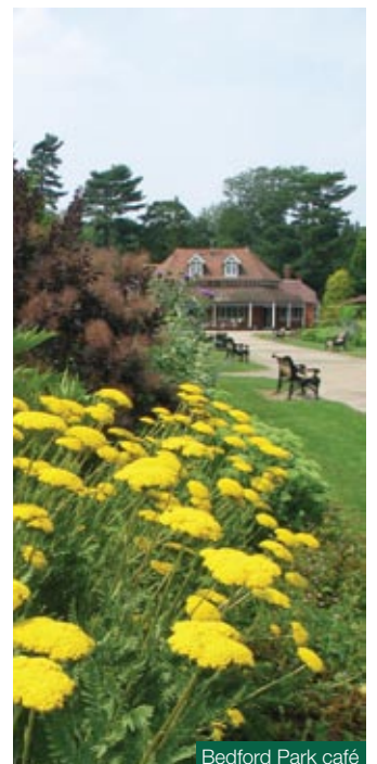
Bedford Park café