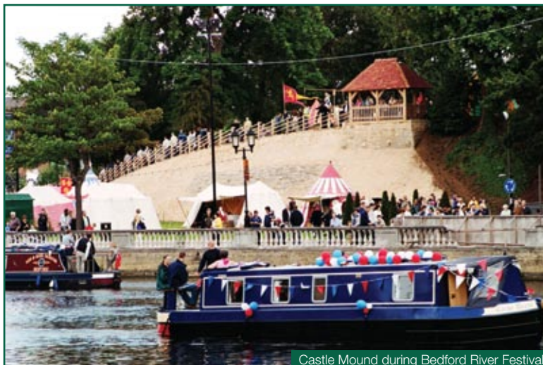
Castle Mound during Bedford River Festival