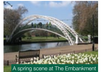
A spring scene at The Embankment

The Embankment we see today was created during the Victorian era and it was during this period that it became quite the most fashionable place to promenade; with its tree lined avenues, formal gardens and open meadows, weirs, bridges and ornate bandstand, there is still no place like it for an afternoon stroll or picnic. The restored bandstand in Mill Meadows hosts a summer programme of concerts and family entertainment. See event pages for more details.