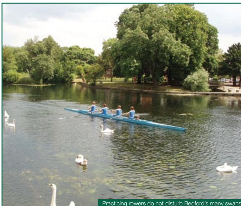
Practicing rowers do not disturb Bedford's many swans

The river acts as a stage not only for sporting excellence but each year for the Festival of Fire and Light. The river is lit with flares and floating candles and illuminated figures drift along on the water. The festival closes with a firework finale lit from the riverbank or a flotilla on the river itself when the town's Christmas lights are switched on. During the summer too, the river provides a beautiful backdrop for afternoons of musical entertainment when the Music in the Meadows series of bandstand concerts take place at the Victorian bandstand on Mill Meadows. (see out event listings for dates in June, July & August).