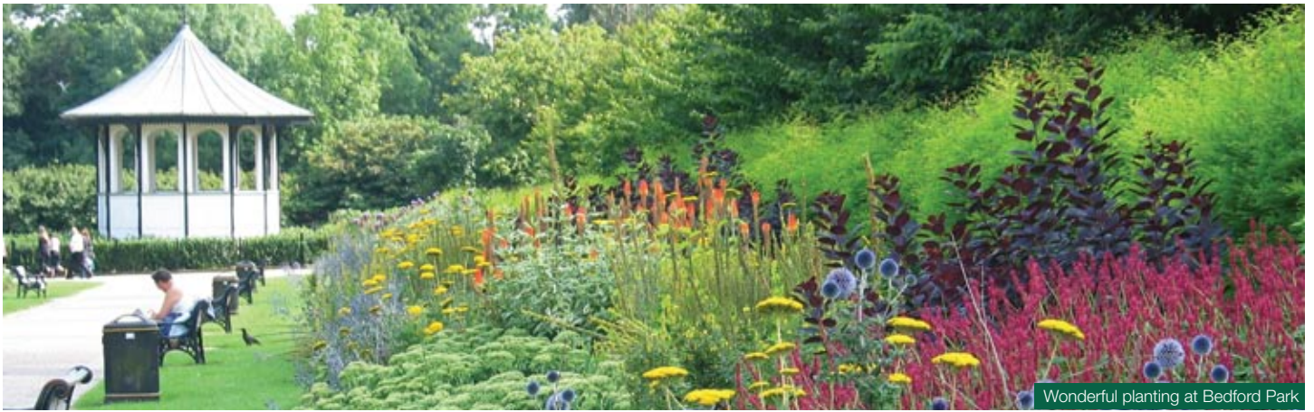
Wonderful planting at Bedford Park