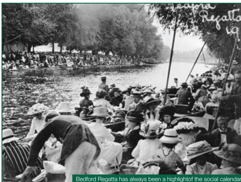
Bedford Regatta has always been a highlight of the social calendar